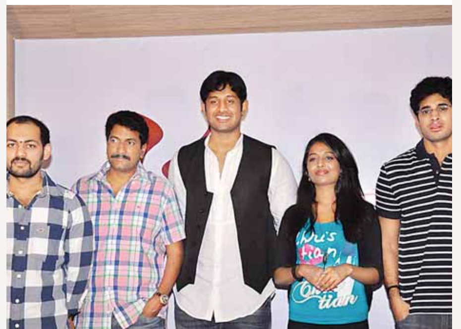
The crew at the logo launch of 'Chemistry'

more fun and entertaining. I was amazed at how joyful everyone seemed in the midst of poverty and simple lives. I wondered what makes them so happy. I found that how much you give is not a function of how much you have, but how big and open your heart is."