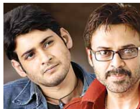
Mahesh Babu & Venkatesh

Victory Venkatesh and Prince Mahesh Babu are ready to share screen space in a multi starrer film. Ace actor Venkatesh also confirmed the news in his recent interview to media. The latest buzz is the film is going on to floors from the next January. Earlier Venkatesh has acted with the actors like Srikanth in Sankranthi and with Kamal Haasan in Eenadu , but for the first time, he will be sharing screen footage with a reigning Telugu star Mahesh. As per the sources Mahesh has given bulk