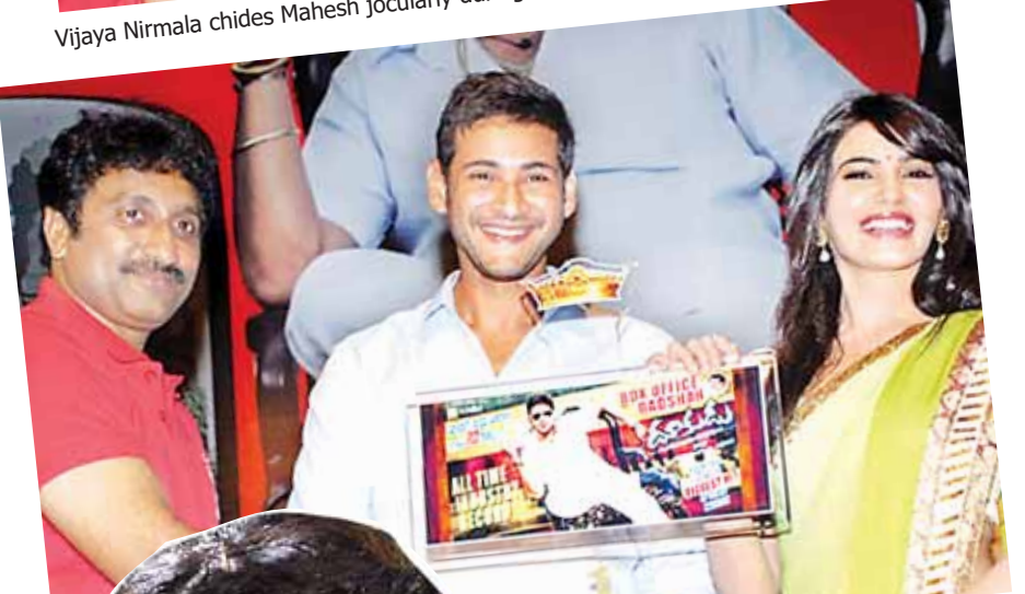
Director Sreenu Vytla, Mahesh and Samantha receive a memento