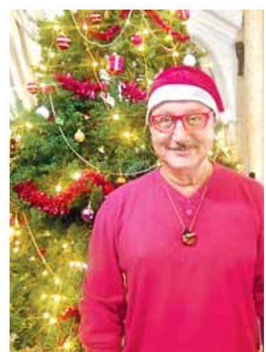
Anupam Kher with a Santa cap for Christmas

Tv coverage of a dead celebrity is very much like a burial service. they give saturation coverage only to forget him forever @SwapnaJourno cinema is not factual fiction...its fictional fact..only brains will understand the difference as an example.. And I might sound preposterous but I can conceive better action sequences, but I don't have the skills to execute Don't know why mindless media speculation will end..time ago m mirror said I alrdy shot a 1cr sng wth madhushalini nd nw sy she's bn replaced