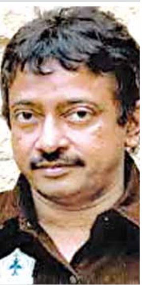
Ram Gopal Varma