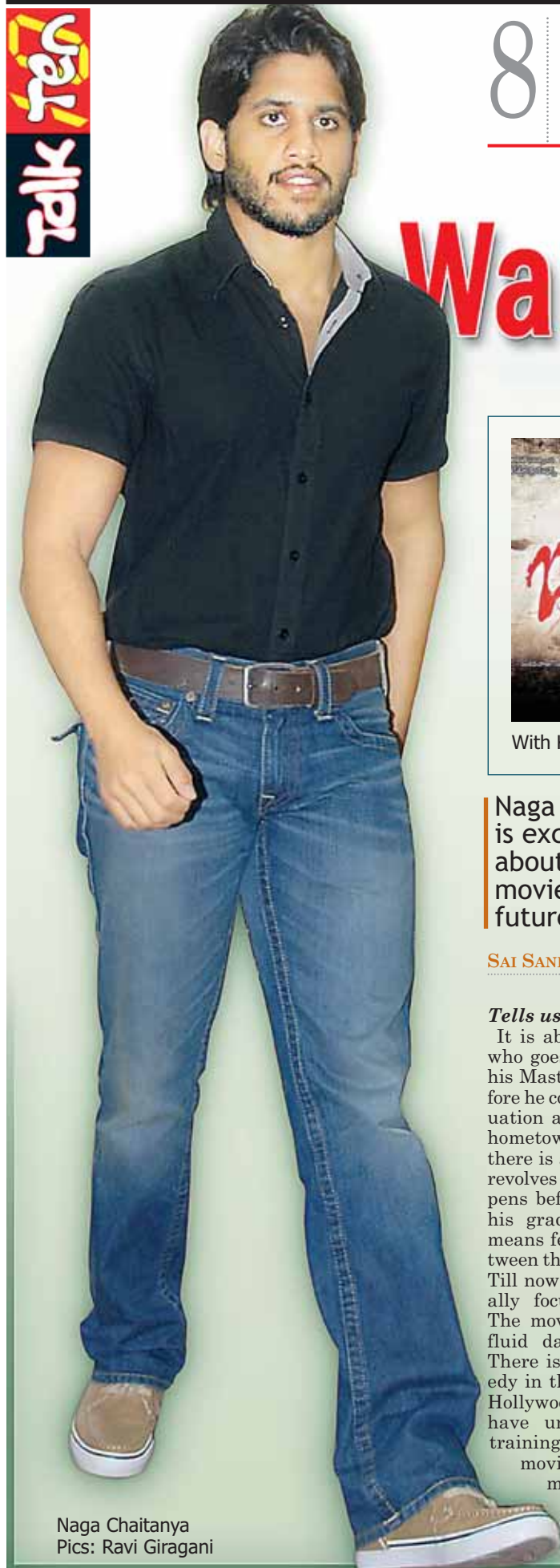
Naga Chaitanya