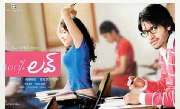
With Tamannah in 100 % Love

Naga Chaitanya is excited about his new movie and his future